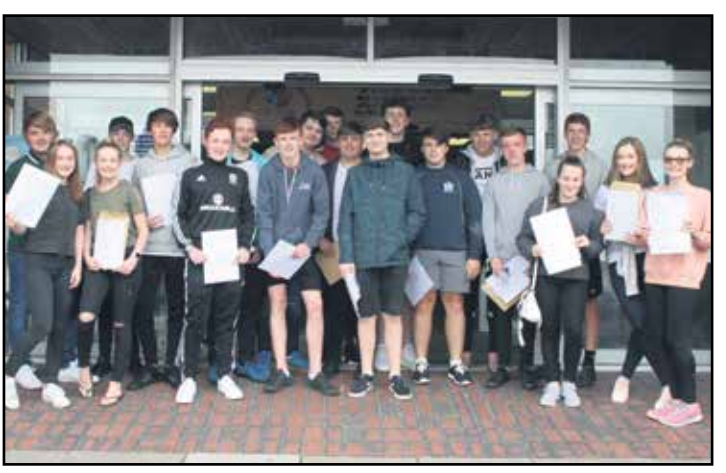
Cyfarthfa High School students eager to go and celebrate

We are delighted to achieve yet another year of best ever results. Pupils at Cyfarthfa excelled themselves moving up on every single statistical indicator which schools are measured by. This is testament to their hard work and that of their teachers. The very special relationships they share, coupled with the support of their families, have set them on the road to success. We are proud to see that 100% of pupils left school with at least 5 qualifications and an amazing 8 achieved 10 or more straight A* / A grades, which is without doubt outstanding! We wish all pupils good luck as they approach the next important step of their careers and are grateful to all who supported this exceptional year group.