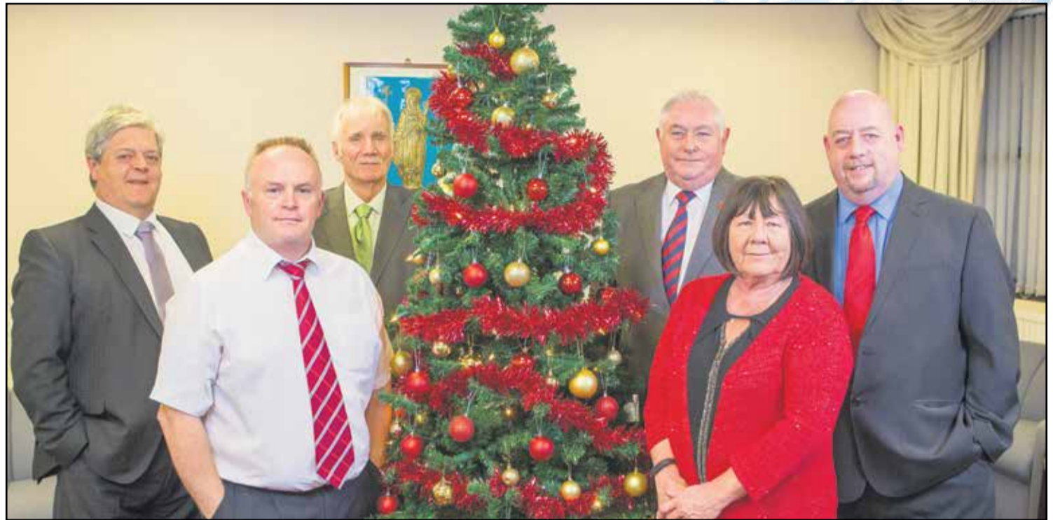
Merthyr Tydfil CBC's Cabinet Members wish you a Merry Christmas happy, healthy and prosperous New Year

With Christmas nearly upon us, there are many fantastic festive events and activities happening across the County Borough to look forward to. The Town Centre and Cyfarthfa Retail Park are already bustling with activity, with people buying seasonal food and gifts